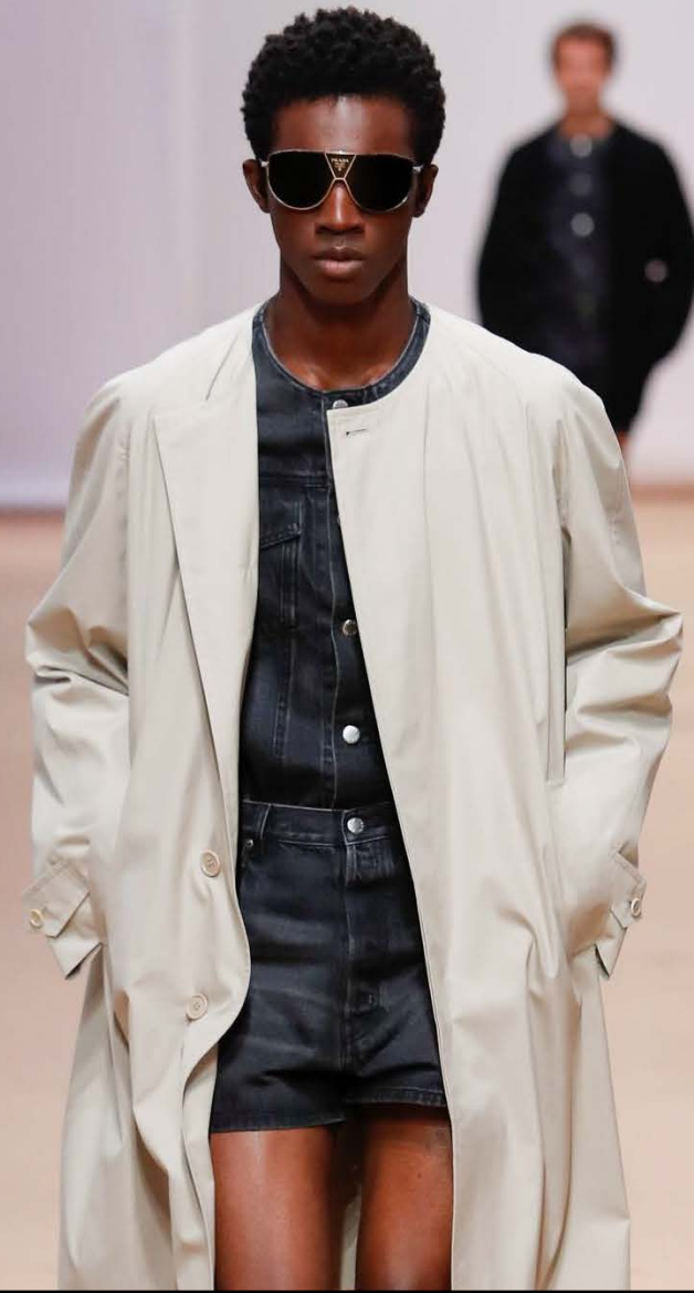
PRADA N1 / SS 2023 COLLECTION