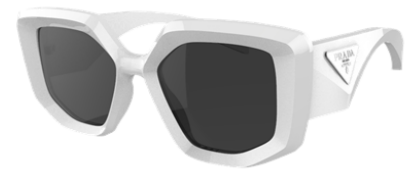
OPR 14ZS- ADVERTISED STYLE