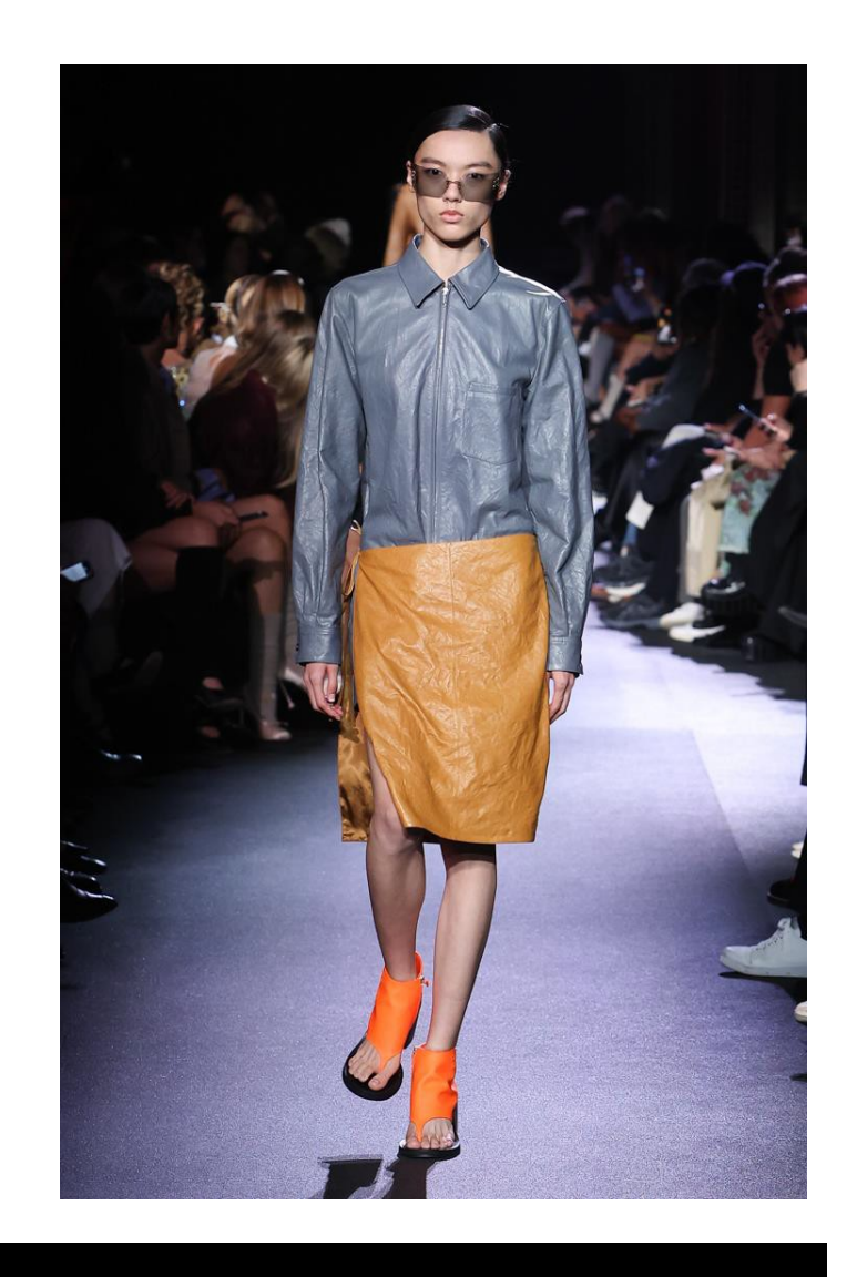
MIU MIU N1/SS 2023 COLLECTION