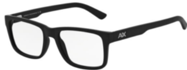
0AX3016 8078 | 53