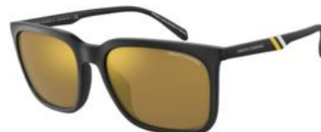
0AX4117SU 807873 | 57