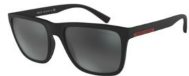
0AX4080S 80786G | 57