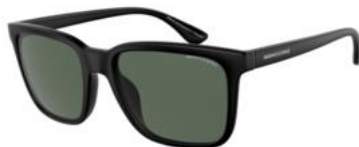
0AX4112SU 807871 | 55