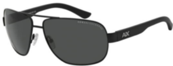
0AX2012S 606387 | 62