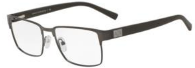
0AX1019 6089 | 54