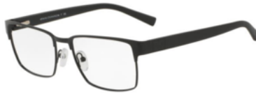
0AX1019 6063 | 54