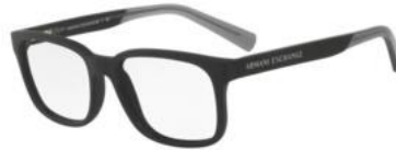
0AX3029 8182 | 54