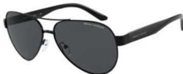
0AX2034S 600087 | 59