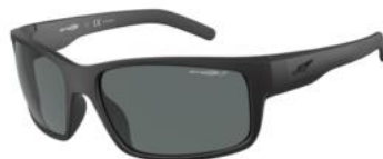
0AN4202 447/81 | 62