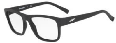
0AN7169 001 | 55