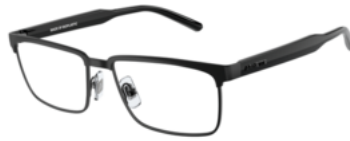
0AN6131 737 | 54