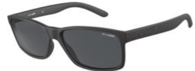
0AN4185 447/87 | 59