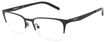
0AN6126 501 | 53